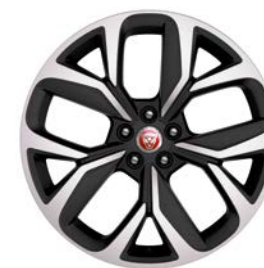
20" 5 SPOKE 'STYLE 5068' WITH DIAMOND TURNED FINISH (Standard on HSE)