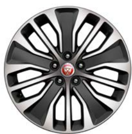
18" 5 SPOKE 'STYLE 5055' WITH DIAMOND TURNED FINISH