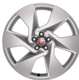
20" 6 SPOKE 'STYLE 6007' (Standard on SE)