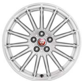
18" 15 SPOKE 'STYLE 1022' (Standard on S)