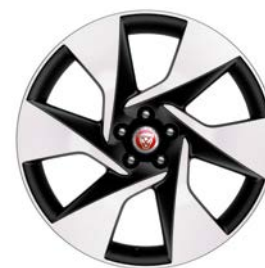
20" 6 SPOKE 'STYLE 6007' WITH DIAMOND TURNED FINISH