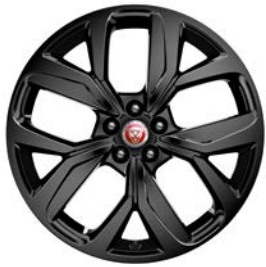
20" 5 SPOKE 'STYLE 5068' WITH GLOSS BLACK FINISH