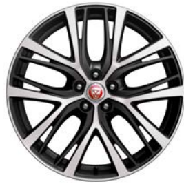
20" 5 SPLIT-SPOKE 'STYLE 5070' IN TECHNICAL GREY WITH POLISHED FINISH