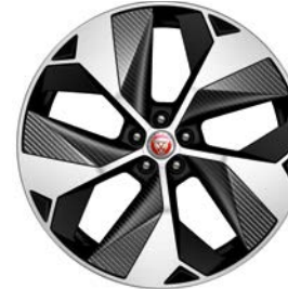
22" 5 SPOKE 'STYLE 5069' IN GLOSS BLACK WITH DIAMOND TURNED FINISH AND CARBON INSERTS