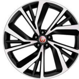
22" 5 SPLIT-SPOKE 'STYLE 5056' WITH DIAMOND TURNED FINISH